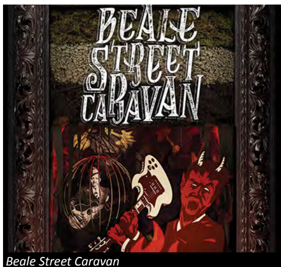
Beale Street Caravan

In 2014, we added several new programs to our radio schedule that reflected our emphasis on American roots music. Beale Street Caravan brings the Memphis sound to our airwaves. We added heft to our blues offerings with the hour-long weekly program Blue Dimensions . We also added Art of the Song and the classic Folk Alley , as well as the storytelling program Snap Judgment .