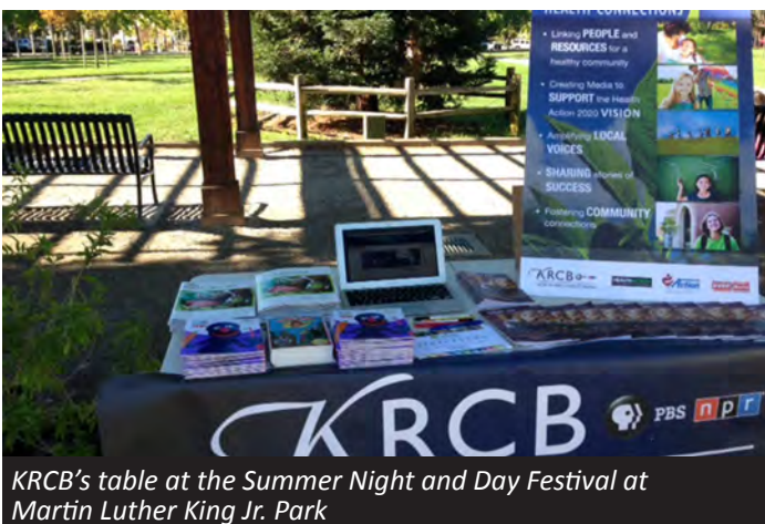
KRCB's table at the Summer Night and Day Festival at Martin Luther King Jr. Park