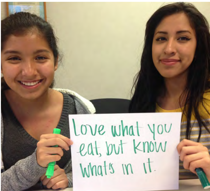
Teens from Community Action's Drug Intervention Group brainstormed dietary ideas as part of a Health Connections activity.