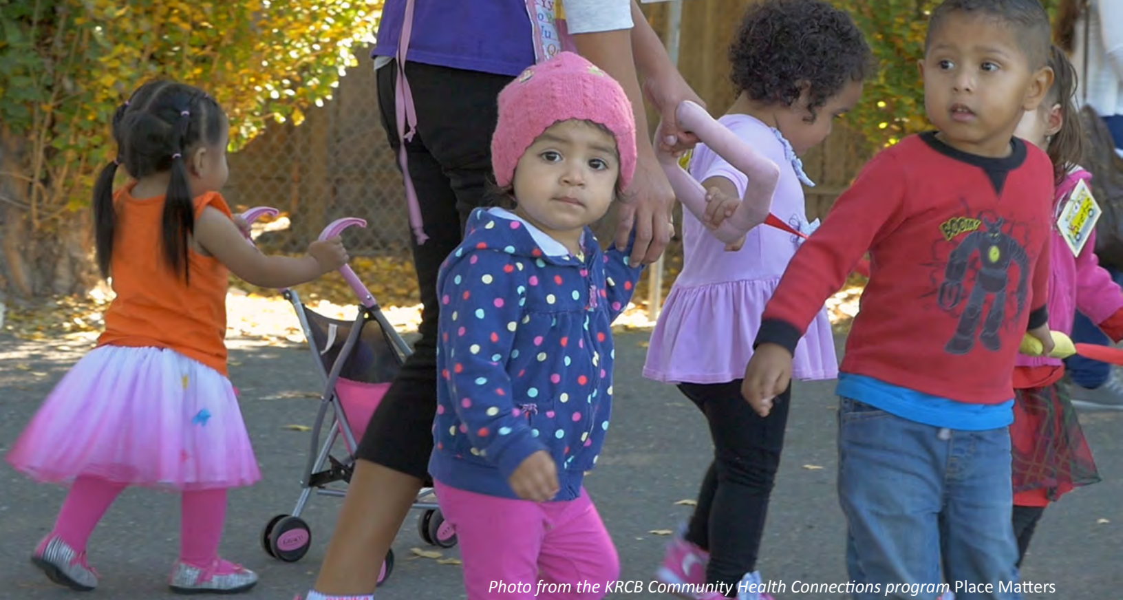
Photo from the KRCB Community Health Connections program Place Matters