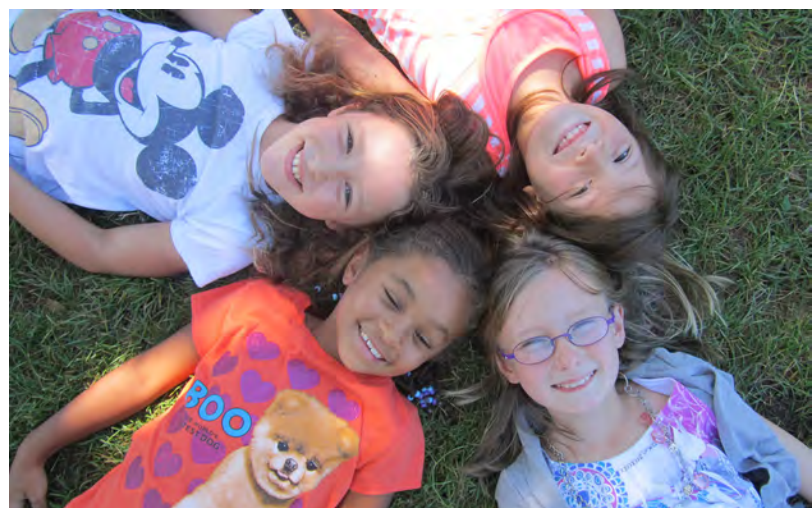
Sonoma County is a hotbed of resistance to vaccination