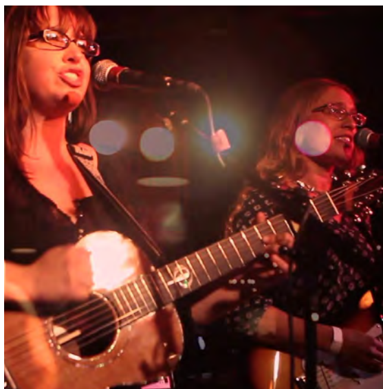
The Bootleg Honeys are a local favorite.